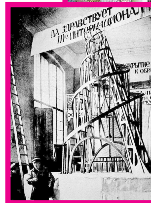
Vladimir Tatlin, Monument to the Third International (1919-1920)